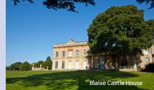
Blaise Castle House

7 Why not end your walk at the Cafe with a freshly made coffee and slice of homemade cake. Open daily serving hot and cold snacks, drinks and a large variety of ice cream.