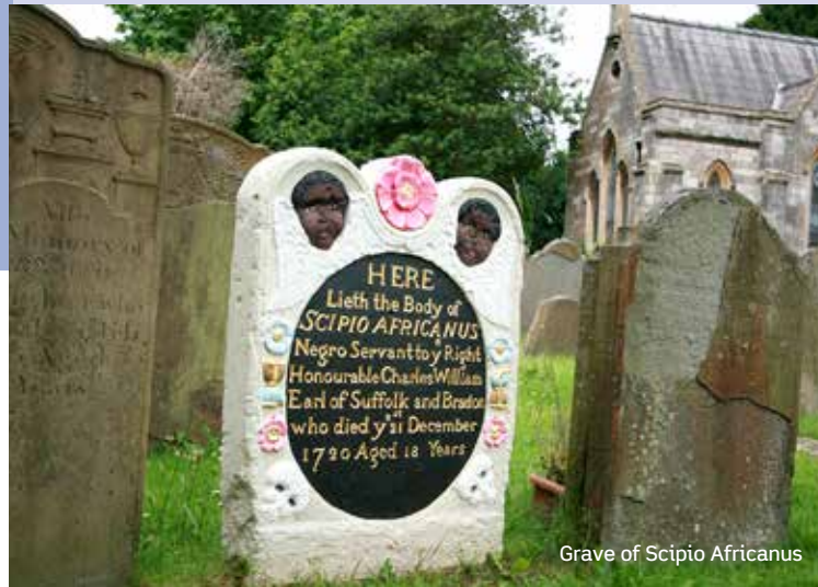
Grave of Scipio Africanus

6 Bear left around the Church and leave by main gates into Church Close. Turn left up Church Lane, passing Telephone Cottage, to enter the estate through a large set of wooden gates. Drive continues up to front of Blaise Castle House.